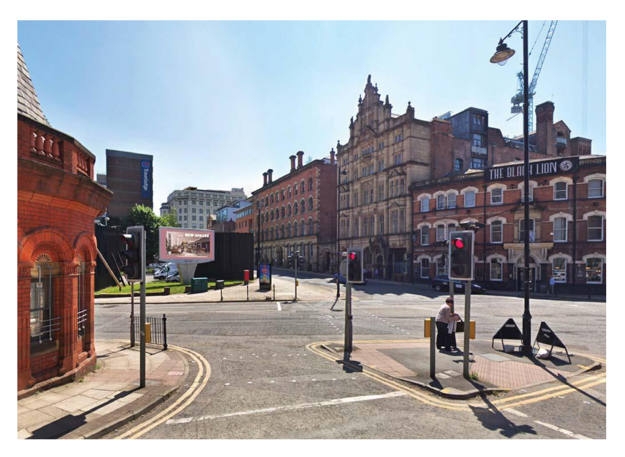
View 3 Looking south from Salford approach along Blackfriars Street with Blackfriars House in the middle view. The rooftop extension would be visible but so too are the existing rooftop structures. The proposal would deliver a more uniform and less cluttered rooftop. The extension would be set back and the parapet would allow the distinct rear elevation of Blackfriars House to remain dominant. The extension would form an addition to the setting of the Grade II listed 10-12 and 14-16 Blackfriars Street, and the Grade II listed Crown Tavern, all in Salford. The extension would be appear as subservient to the original building, and would not project above the rooflines of the aforementioned listed buildings.

the parapet, and the set back from this parapet, means only a small section would be visible. The dominant form of Blackfriars House means that the extension would be read as a minimal, subservient intervention.