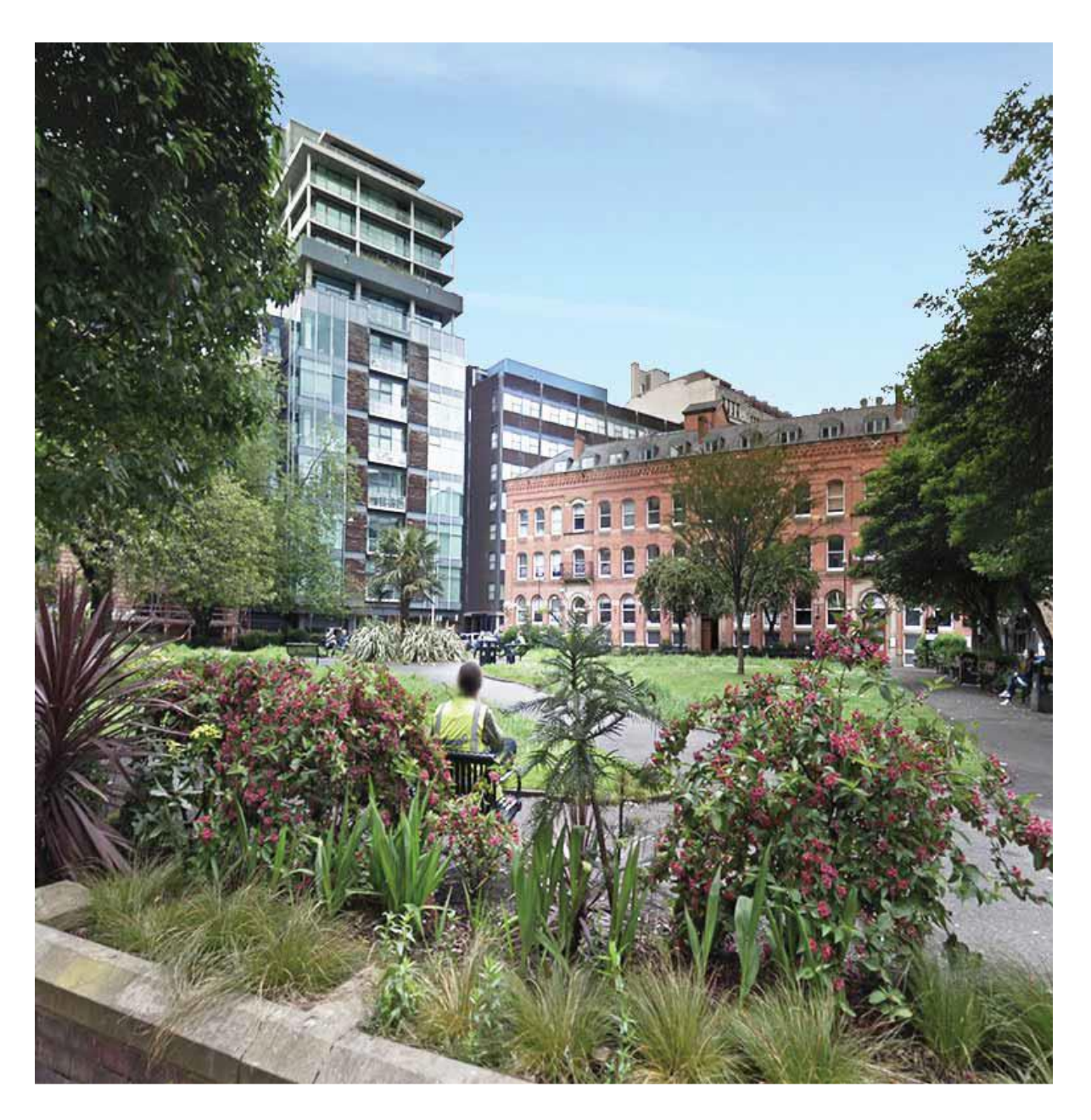
View 4 Looking North from Arkwright House across Parsonage Gardens which shows the proposal projecting slightly above the existing building. However, it would remain subservient to other features on Blackfriars House roofscape. The principle elevation of the proposal would be lightweight glass and whilst it would visible, it would be subservient to the existing building.

The Street Level Visual Impact Study demonstrates that the overriding cumulative impact when considered alongside the existing townscape, including the identified listed buildings and the Parsonage Gardens Conservation Area would be minimal. It would generally add a positive element to the setting and would generally be complementary to the character of the conservation area.